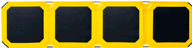
Super-efficient 10 watt solar panel (4 x 2.5 watt)