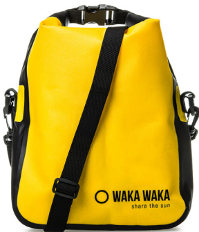
Rugged waterproof pouch