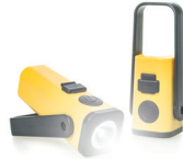
Two LED lights One is rechargeable