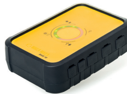
One button-controlled battery pack + water-resistant bumper